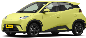
Seagull 2024 Honor Edition 305KM Vitality...